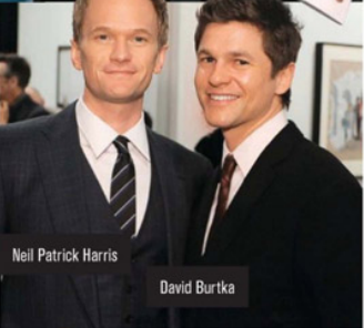
Neil Patrick Harris